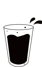
Glass of orange juice